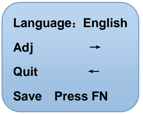
Set Language Windows